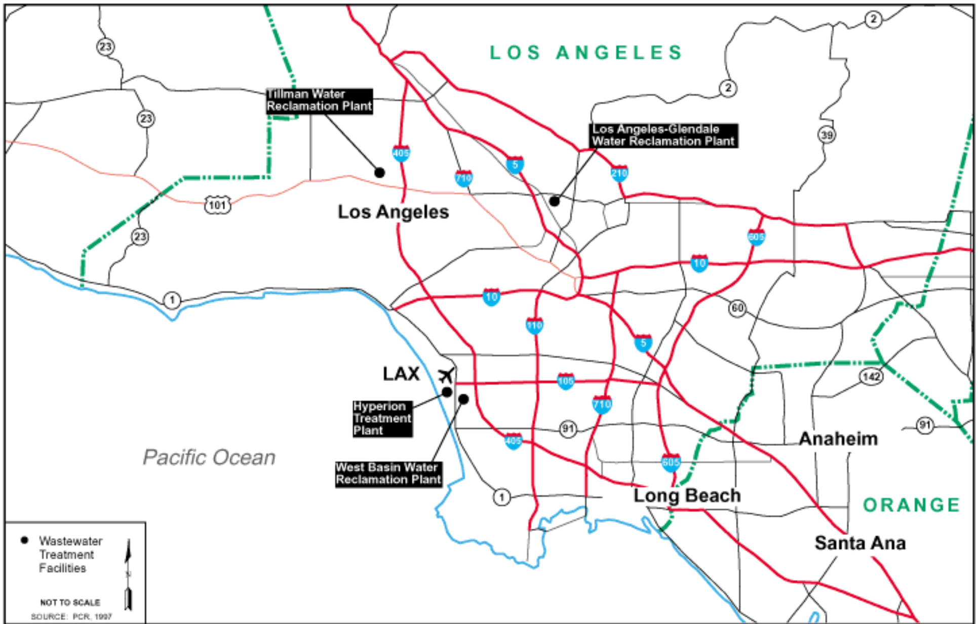
Los Angeles International Airport Master Plan